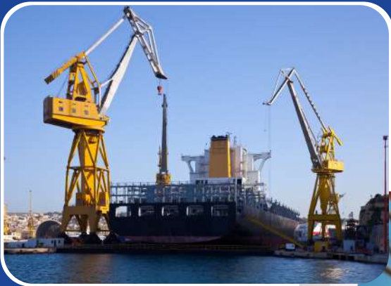
Oil & Gas Services (Sesimic Data Services)