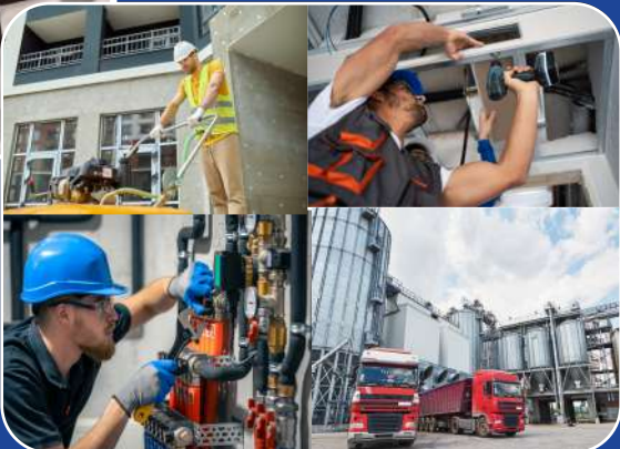
Project Support Services